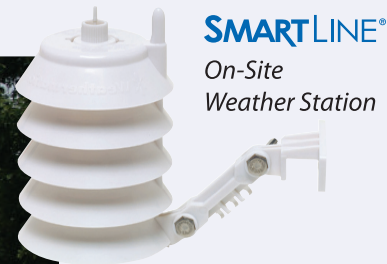
SMARTLINE® On-Site Weather Station